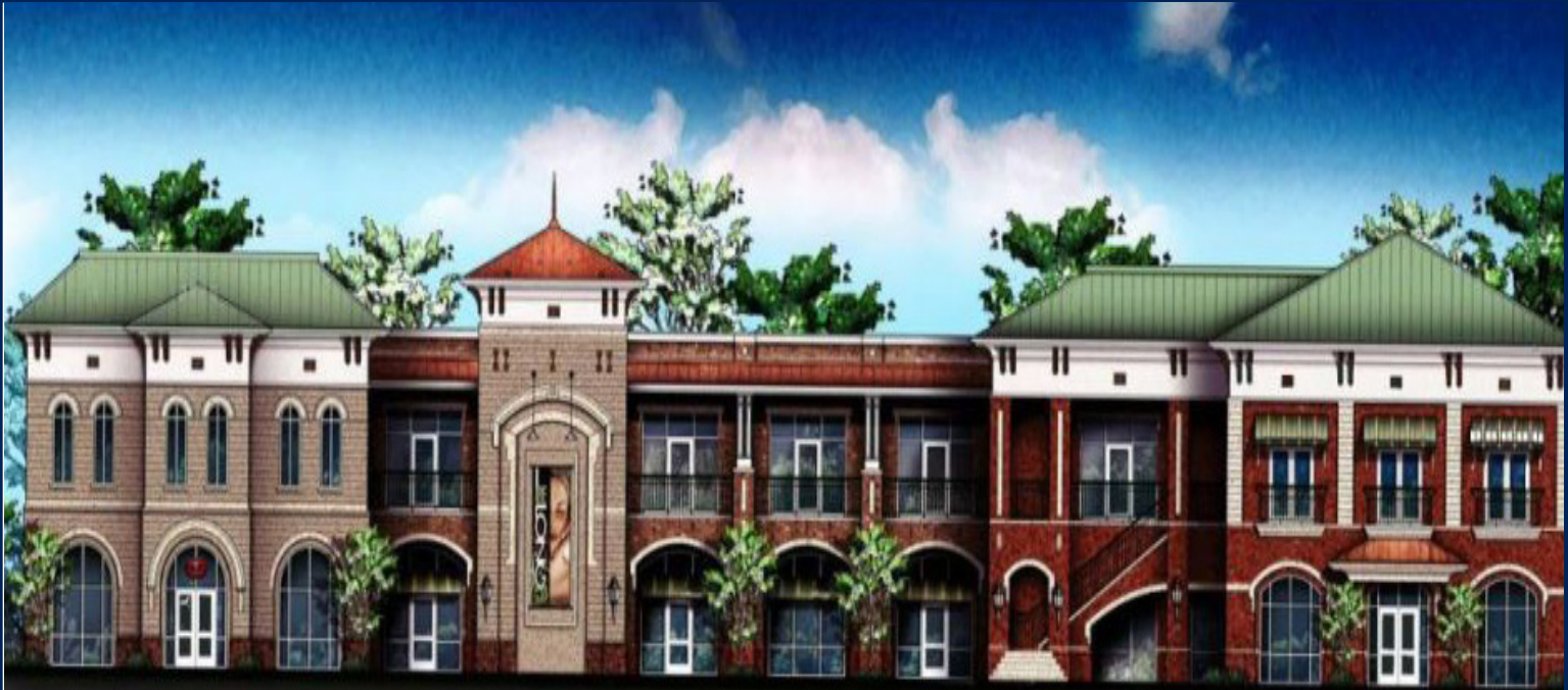
Proposed optional rendering of front facade of retail/office center

2230 Cecil Ashburn Drive SE, Huntsville, AL 35802